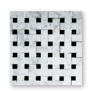
Basketweave with Nero Marquina