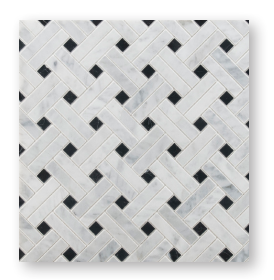
Diagonal Weave with Nero Marquina