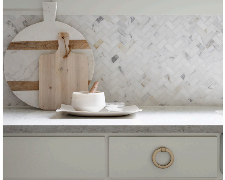
Large Herringbone Mosaic

Our Calacatta Borghini is from the famed Borghini quarry in Italy. A soft white backdrop sets the stage for the gorgeous honey colored veining that has become synonymous with this classic stone.