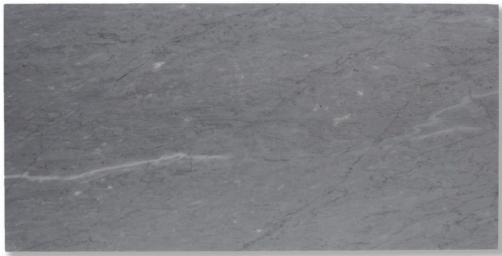
12" x 24" Honed