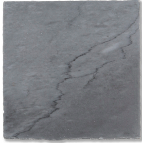
9" x 9" Old World