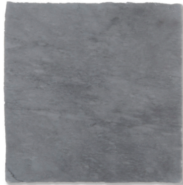
18" x 18" Old World