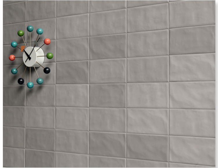
5"x9" Field in Grigio Blend

Made to replicate handmade ceramic tile, the gentle ripples and variations in tone create a dynamic surface texture that gives the tile an artistic echo. Evoking a vision of the most beautiful roofs throughout iconic cities of the world, Tatum eliminates the spatial difference between ceiling and floor.