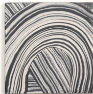
8"x8" Elope in Ebony