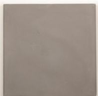
8"x8" Field in Oatmeal