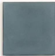
8"x8" Field in Azure