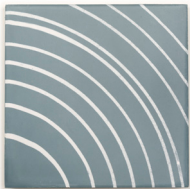
8"x8" Swell in Azure