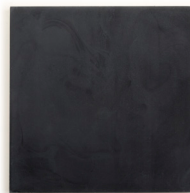
8"x8" Field in Ebony

*Please note: variations in color, shade, surface texture and size are natural characteristics of all our products and should be expected. Images shown are representative, but may not indicate all variations in these characteristics.