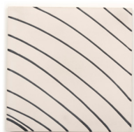
8"x8" Swell in Ivory