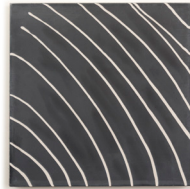
8"x8" Swell in Ebony