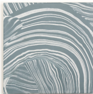
8"x8" Elope in Azure