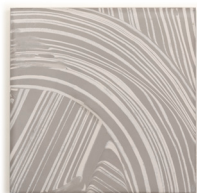
8"x8" Elope in Oatmeal