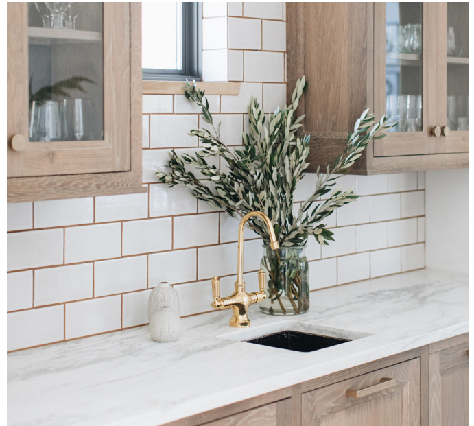
4"x8" Field in New Spiced Ginger Gloss

The Ann Sacks Elements collection features a range of color and sizes. It is ideal for interiors of various styles - from Arts and Crafts to European to Contemporary. Elements Formatti is a large format option within the Ann Sacks Collection. Available in 12" and 16" formats, Formatti is offered in most MADE Earthenware colors.