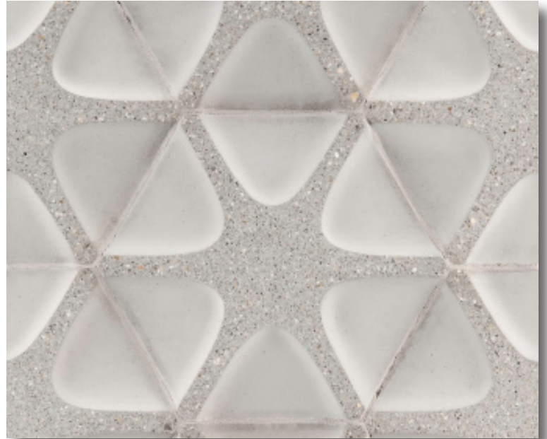
Product Shown: Spoke in Fog Glass 7 13/16" x 9 1/6" Field.