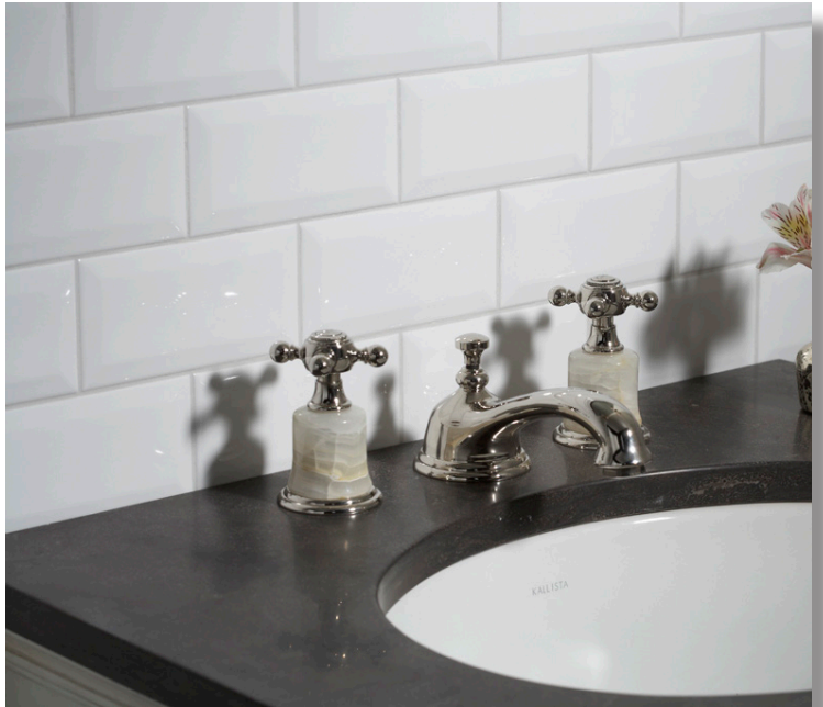
3x6 Beveled white field