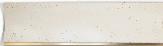
8"x32" Pas Deco Conbrass