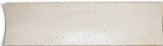
8"x32" Pas Deco