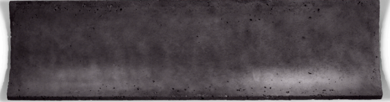
8"x32" Pas Deco