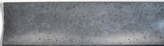
8"x32" Pas Deco