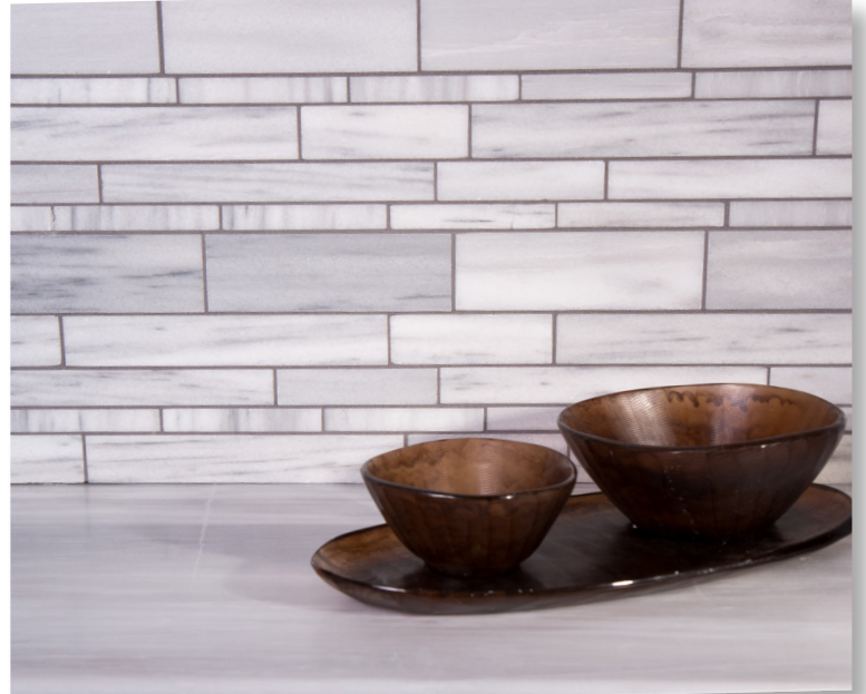
Random Linear Mosaic (wall), 12"x24" field (counter)

Lana is a creamy white stone with predominant gray veining that breaks the surface in a gentle, lineal pattern. There is a luminescence and depth to its coloration and a velvety brushed surface that begs to be touched.