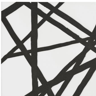
Maven - pattern: Solstice III

The three collections – Maven, Tableau, and Liaison – are the first of five collections being